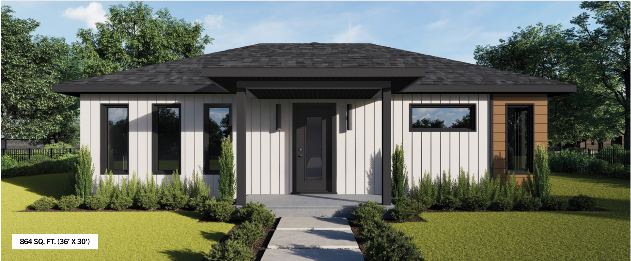
864 SQ. FT. (36' X 30')