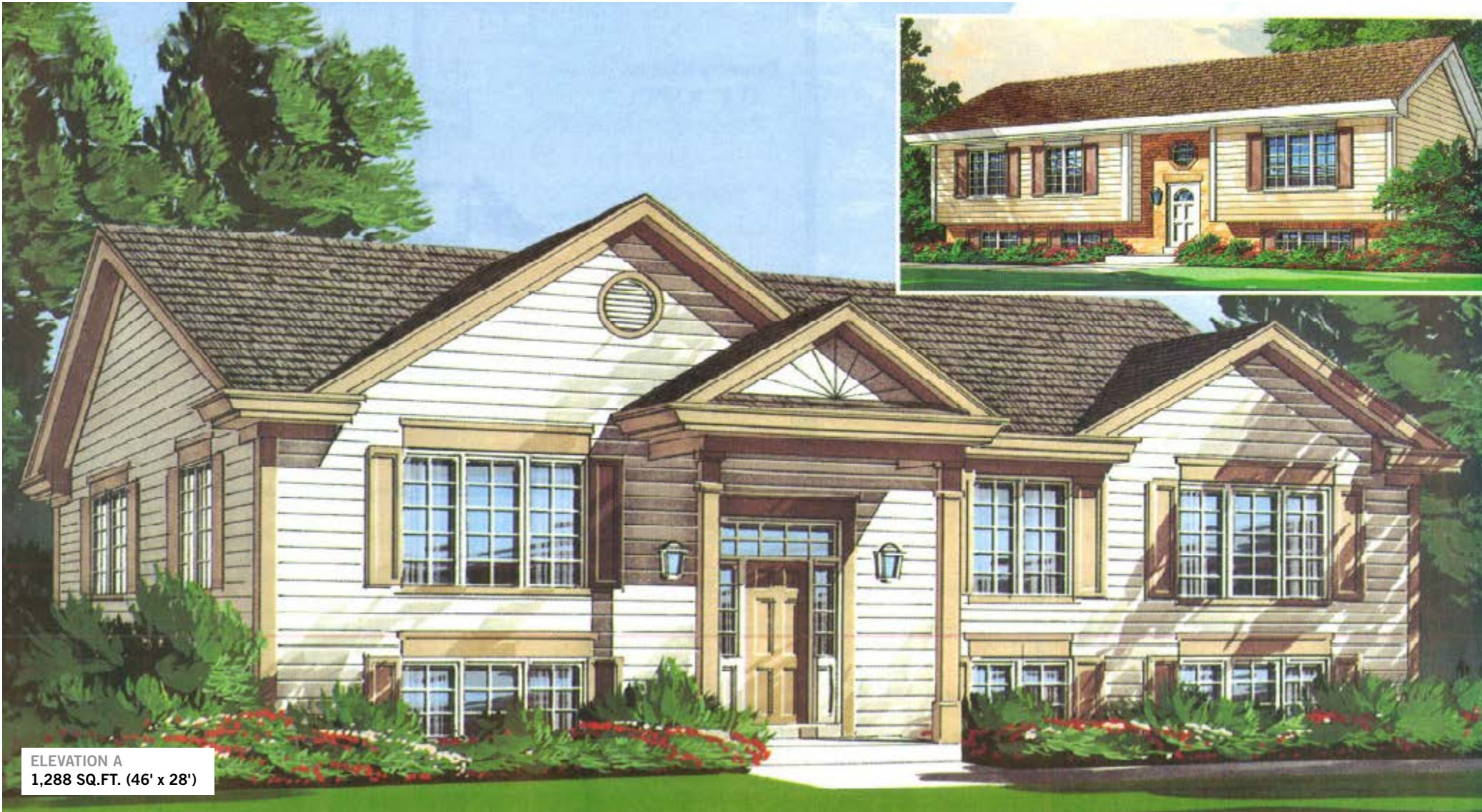
ELEVATION A 1,288 SQ.FT. (46' x 28')