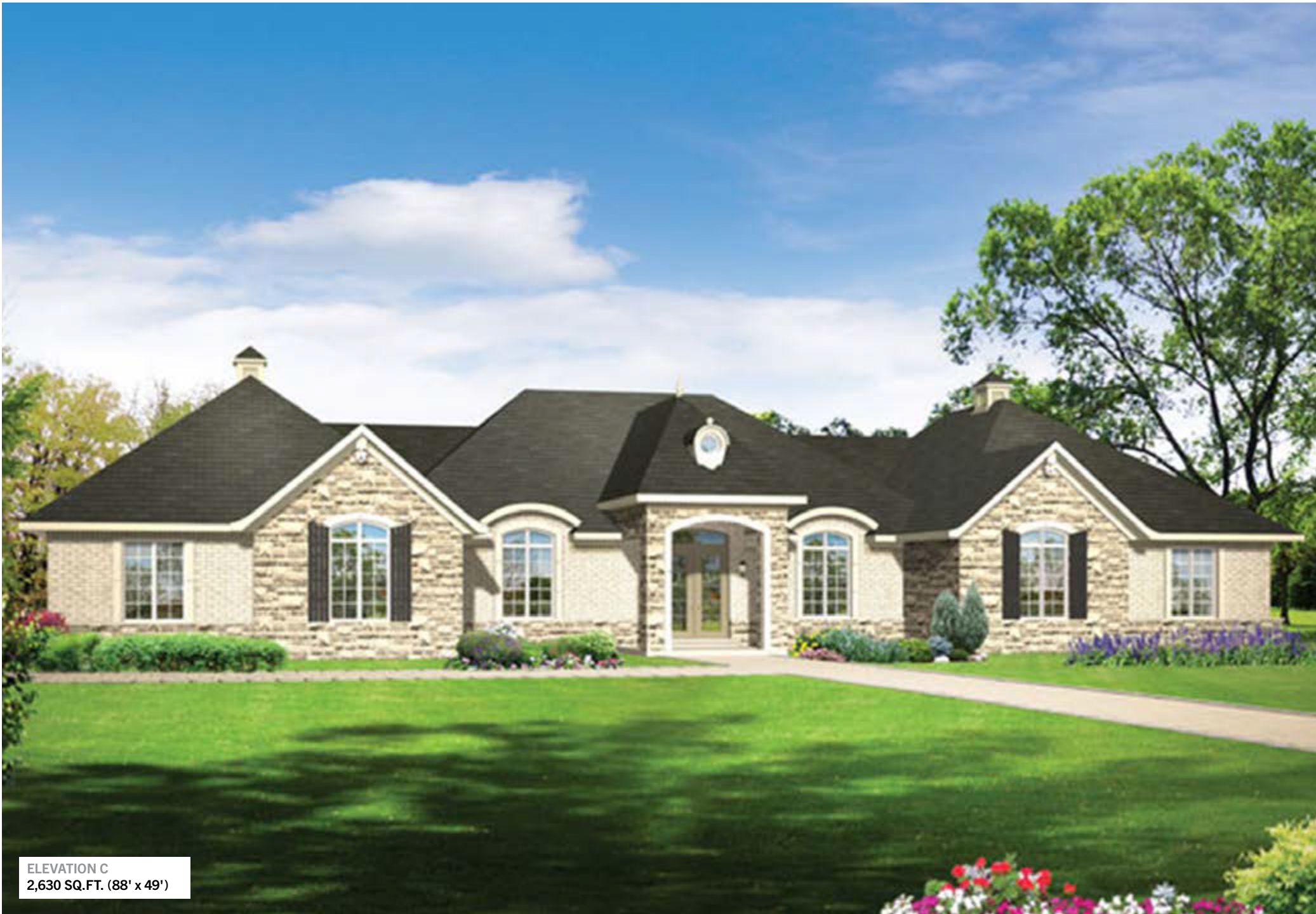
ELEVATION C 2,630 SQ.FT. (88' x 49')