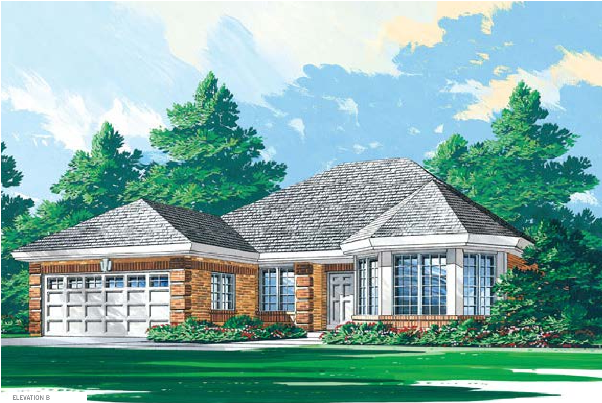
ELEVATION B 1,394 SQ.FT. (46' x 38')