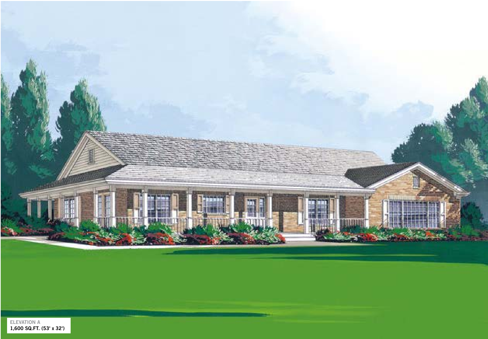
ELEVATION A 1,600 SQ.FT. (53' x 32')