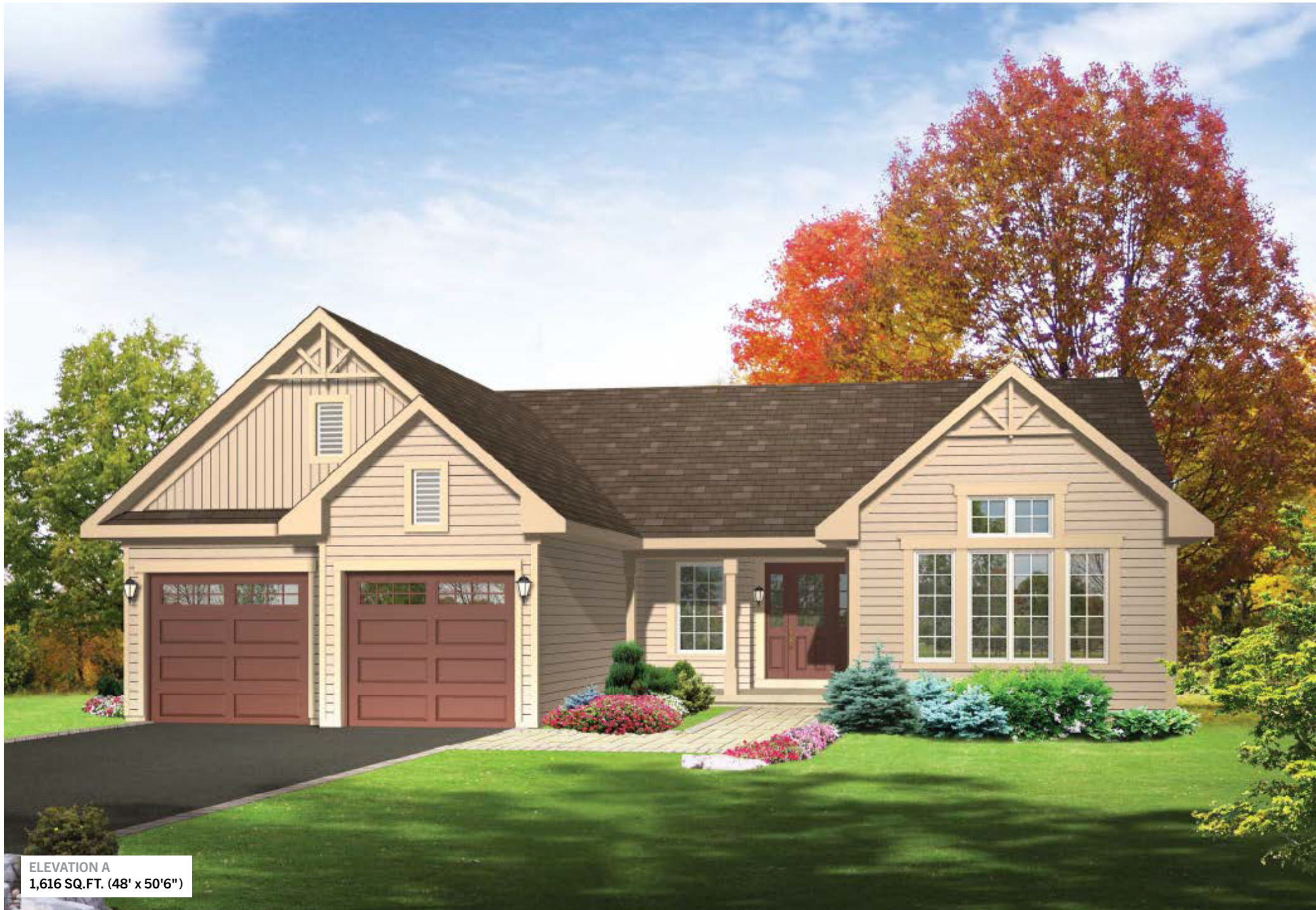
ELEVATION A 1,616 SQ.FT. (48' x 50'6")